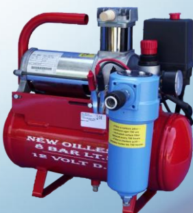
ELECOM12DCLT5VEF 38x30xh34 Kg.8 Special Filter