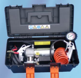
VALGRU12CC20VE 53x29xh27 Kg.5