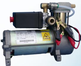
GRU12CC20VEDIR 21x11xh17 Kg.3.5