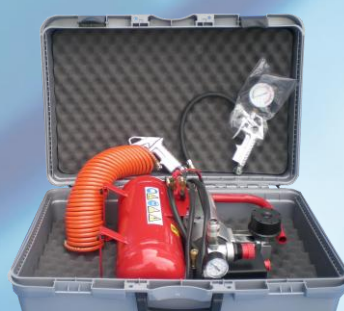
ELECOM12DCLT5VEVAL 58x22xh41 Kg.9