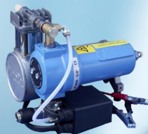
GRU12CC20VEDIRF 21x19xh17 Kg.4.5 Special Filter